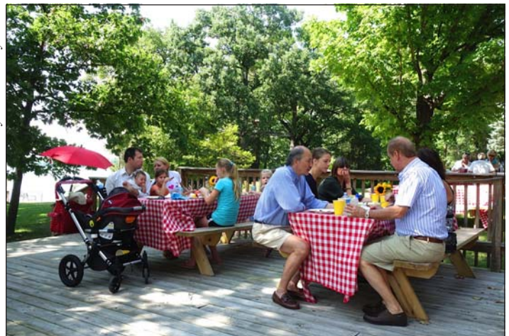
UMANA Illinois members, young and old, enjoying the annual UMANA Picnic