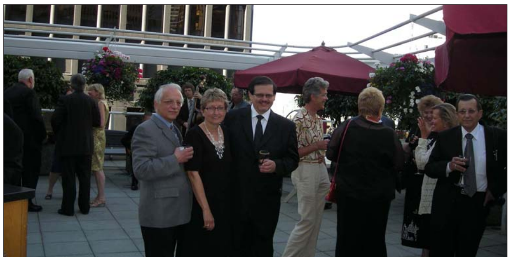
UMANA members enjoy a social hour at the Vancouver Pinnacle Hotel.